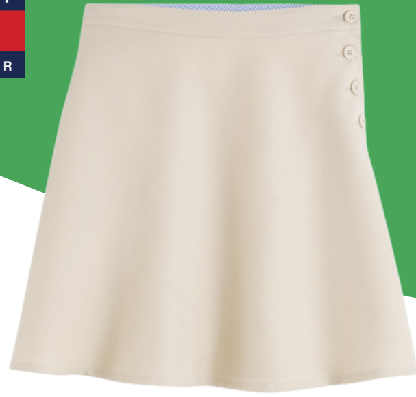
Khaki A-Line Side-Button Skort

Short or Long-Sleeve Navy Polo with CAW logo on Left Chest