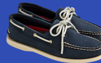
White Ankle Socks Khaki or Navy Boat Shoes